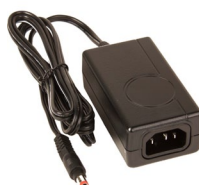
-2 = Barrel Connector and Universal AC/DC Power Adapter, 100-240VAC, 50-60Hz (requires AC power cord)