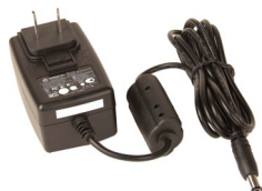
-1 = Barrel Connector and US AC/DC Power Adapter, 100-240 VAC, 50-60Hz