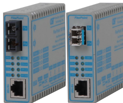
SFPs not included

FlexPoint unmanaged media converters are easy to use and provide dependable fiber connectivity in Enterprise and Government networks around the world.