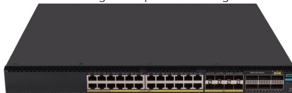
HPE NW CW Sw 24T 8P 6C 5720 (S2N59A)

Moreover, these switches support HPE Intelligent Management Center (IMC), which delivers a consistent network manageability experience. Through centralized configuration, compliance, policy management, monitoring, and troubleshooting, HPE IMC streamlines network management processes for greater efficiency.