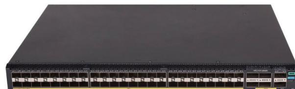
HPE NW CW Sw 48P 6C 5720 (S2N58A)