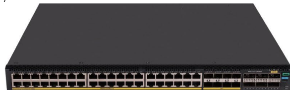
HPE NW CW Sw 40T 8P 6C 5720 (S2N60A)