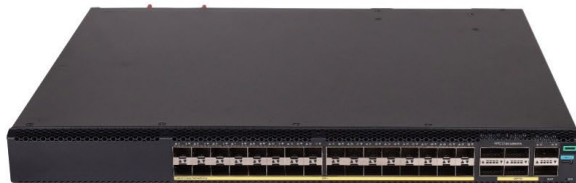
HPE NW CW Sw 32P 6C 5720 (S2N57A)