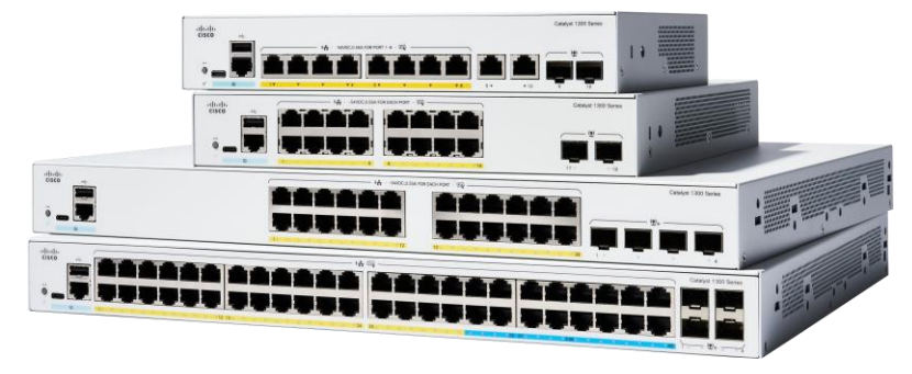
Figure 2. Cisco Catalyst 1300 Series switches

The Cisco Catalyst 1300 Series Switches are fixed, managed, enterprise-class Gigabit Ethernet Layer 3 switches designed for small and medium-sized business and branch offices. These simple, flexible, and secure switches are ideal for deployment out of the wiring closet. The Catalyst 1300 Series operates on customized Linux OS software, with an intuitive dashboard that simplifies network setup and advanced features that accelerate digital transformation, while pervasive security protects business-critical transactions. The 1300 Series switches provide the ideal combination of affordability and capabilities for small and medium-sized businesses and help you create a more efficient, better-connected workforce. When your business needs advanced networking features and security for the digital transformation, yet value is still a top consideration, you're ready for the Cisco Catalyst 1300 Series Switches.