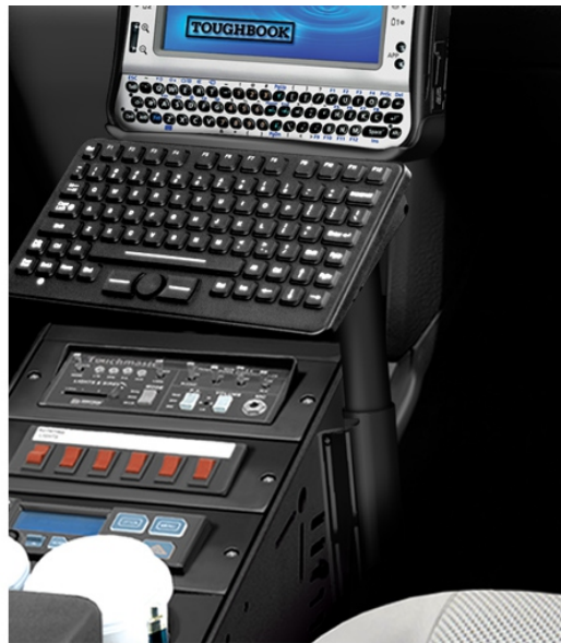
On RAM Console Box