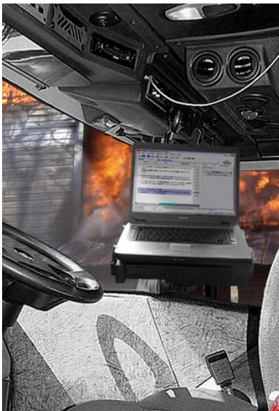
In Vehicle Facing Driver