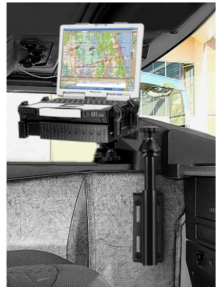
In Vehicle Facing Passenger

RAM Mounting Systems 8410 Dallas Ave S Seattle, WA 98108 Phone: (206) 763-8361 Fax: (206) 763-9615 www.rammount.com support@rammount.com