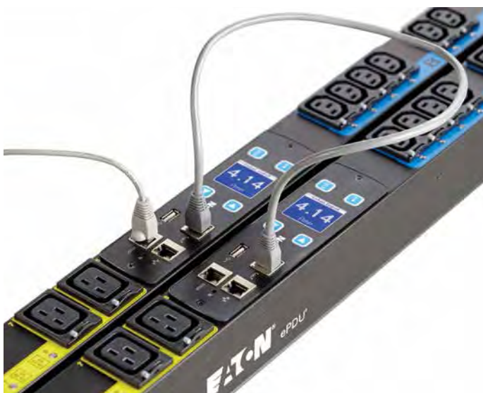
A and B power PDU sharing a network connection via daisy chain

Eaton's new patented daisy-chain capability allows up to eight ePDUs to share the same network connection and IP address. Unlike competitive rack PDUs that require a dedicated IP address for best performance, Eaton technology provides a 87.5 percent reduction in network infrastructure costs.