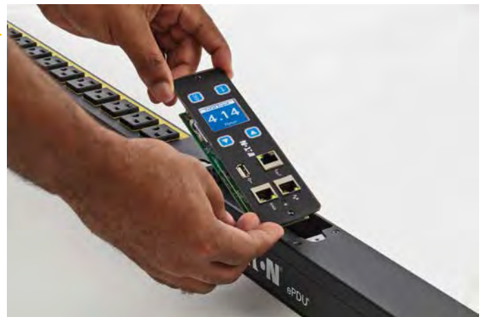
Module being removed without removing power to the ePDU

Eaton's new hot-swap eNMC (ePDU Network Management and Control) module can be replaced without the need to power down your rack. Increase uptime while enhancing serviceability and saving on unnecessary service calls. The menu-driven pixel display allows for easy setup and troubleshooting.