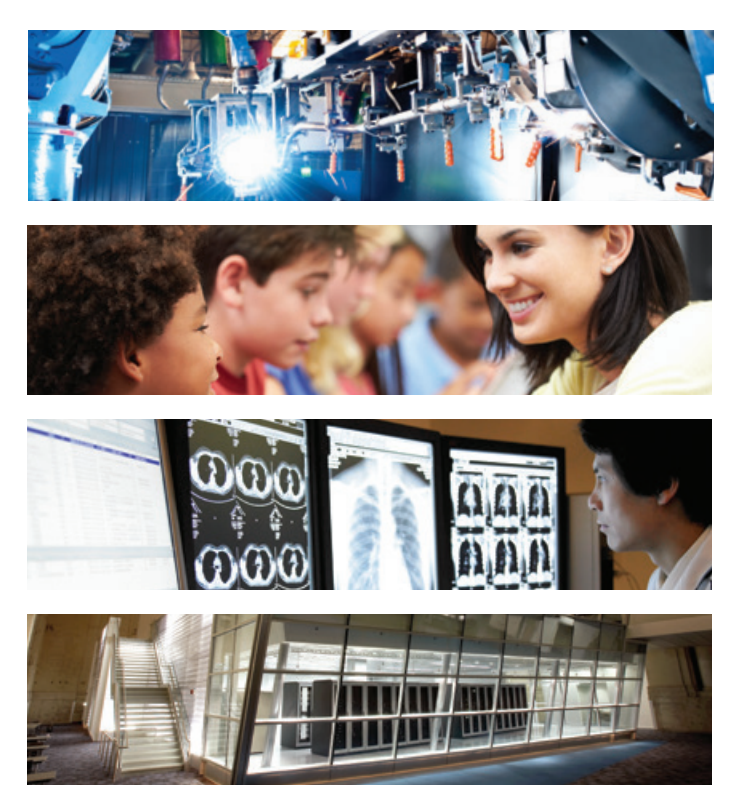
The 9PX can withstand harsh electrical environments, but still works in a variety of applications—industrial automation, K-12, healthcare, IT and more.

Products need to work anywhere. The 9PX's rack or tower form factor makes it adaptable to your environment. (The LCD interface, surrounding bezel and logo even rotate to match your installation.) RT models are available in multiple voltage and wattage variations to meet your needs and include a four-post rail kit.