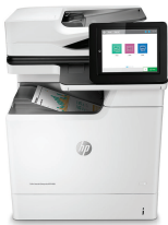
HP Color LaserJet Enterprise MFP M681dh

This HP Color LaserJet MFP with JetIntelligence combines exceptional performance and energy efficiency with professional-quality documents right when you need them—all while protecting your network with the industry's deepest security. 1