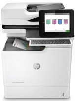
HP Color LaserJet Enterprise Flow MFP M681f