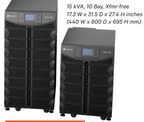
AS5 & AS6 Series

20 kVA, 16 Bay, Xfmr-free 17.3 W x 33.5 D x 38.2 H inches (440 W x 850 D x 970 H mm)