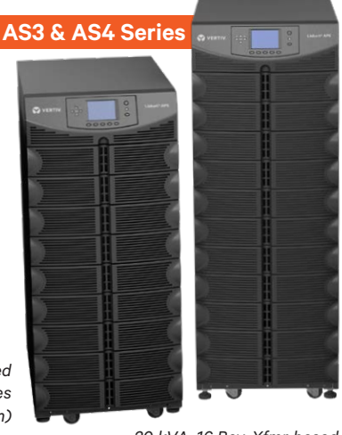
20 kVA, 16 Bay, Xfmr-based 17.3 W x 33.5 D x 48.8 H inches (440 W x 850 D x 1240 H mm)

15 kVA, 12 Bay, Xfmr-based 17.3 W x 31.5 D x 41.7 H inches (440 W x 800 D x 1060 H mm)