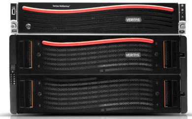
NetBackup 5340 Appliance

The NetBackup 5340 is offered in a High Availability (HA) configuration. The HA configuration increases system reliability, provides higher backup and recovery throughput as well as higher operational availability at significantly lower operational costs.