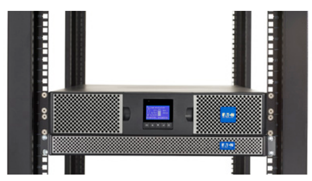
2U UPS with 1U EBM in 4-post rack

The 9PX lithium-ion UPS is part of the Eaton 9 series singlephase double-conversion UPS line, best applied to mission-critical equipment for constant power conditioning. The 9PX lithiumion UPS provides 8 to 10 years of life expectancy for UPS and its batteries, and has power ratings ranging from 1 to 3 kVA, while also offering up to four external battery modules (EBM) for extra runtime. The 9PX lithium-ion UPS has the same reliable features as the 9PX lead-acid UPS, including load segments for prioritized shutdowns, remote power on (RPO), remote on/off (ROO) and output relay ports that increase control capabilities. For connectivity, the 9PX is compatible with the Gigabit Network Card (NETWORK-M2), which is the first UPS connectivity device to meet both UL and IEC cybersecurity standards. This network interface card improves power system reliability by providing warnings of pending issues and helping to perform orderly graceful shutdown of servers and storage.