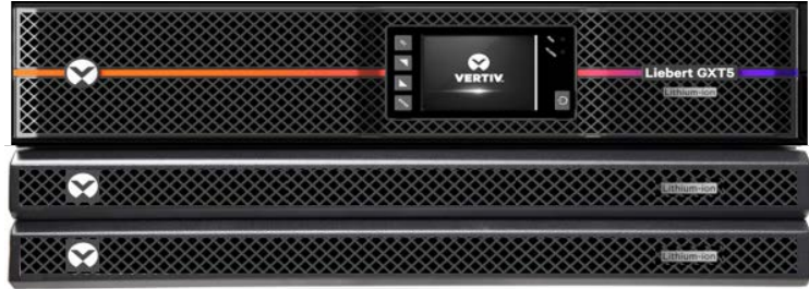
Liebert® GXT5LI 1-3KVA UPS and (2) EBC For Extended Runtime

Lithium-ion technology delivers two to three times the useful life of lead-acid batteries along with a lower total cost of ownership, making the Liebert® GXT5 Lithium-Ion online UPS ideally suited for network and server rooms, and other mission-critical edge applications.