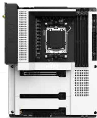
N7 B650E - All White