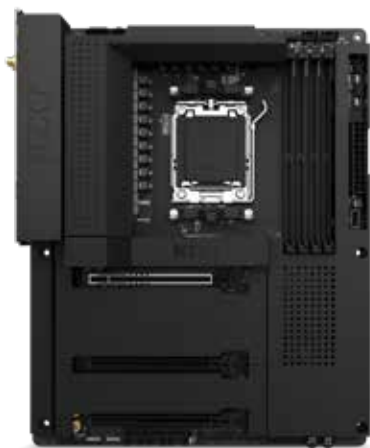
N7 B650E - All Black