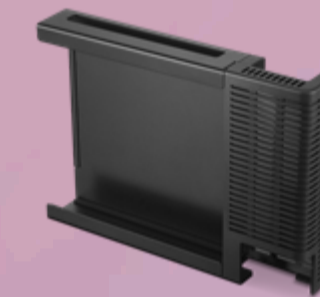
ThinkCentre Tiny Mounting Kit 4XF1R07369

Please click here to view the full list of accessories.