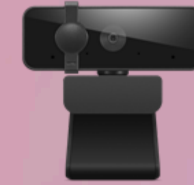
Lenovo Essential FHD Webcam Gen2 4XC1S15018