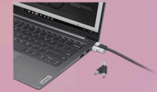
NanoSaver Cable Lock from Lenovo 4XE1L51710