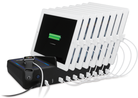
Figure 3: Application

10-Port USB Charging Station with Ambient Light Deck is an ideal charging companion which enables you to charge up to 10 USB powered devices simultaneously. Built in 8 individual open slots and a roomy padded deck keep your devices organized while charging.