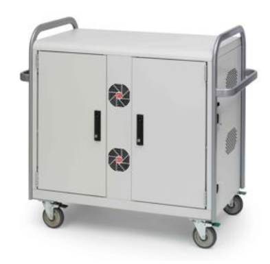
MDMLAP32NR 32 Laptop Computers in <u>Vertical</u> Slots