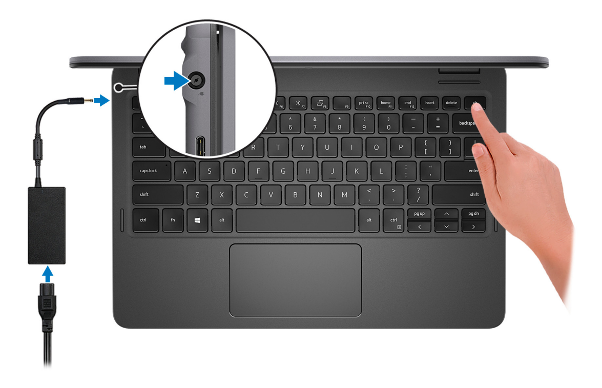
Latitude 3140 2-in-1